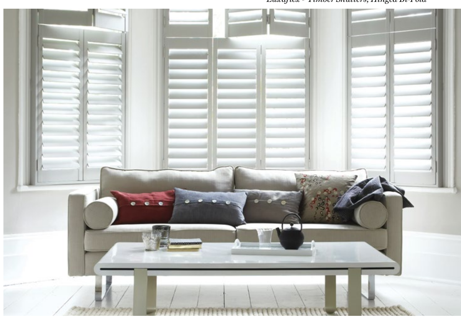
Luxaflex {\small \circledR}\ Timber\ Shutters, Hinged\ Bi\text{-}Fold