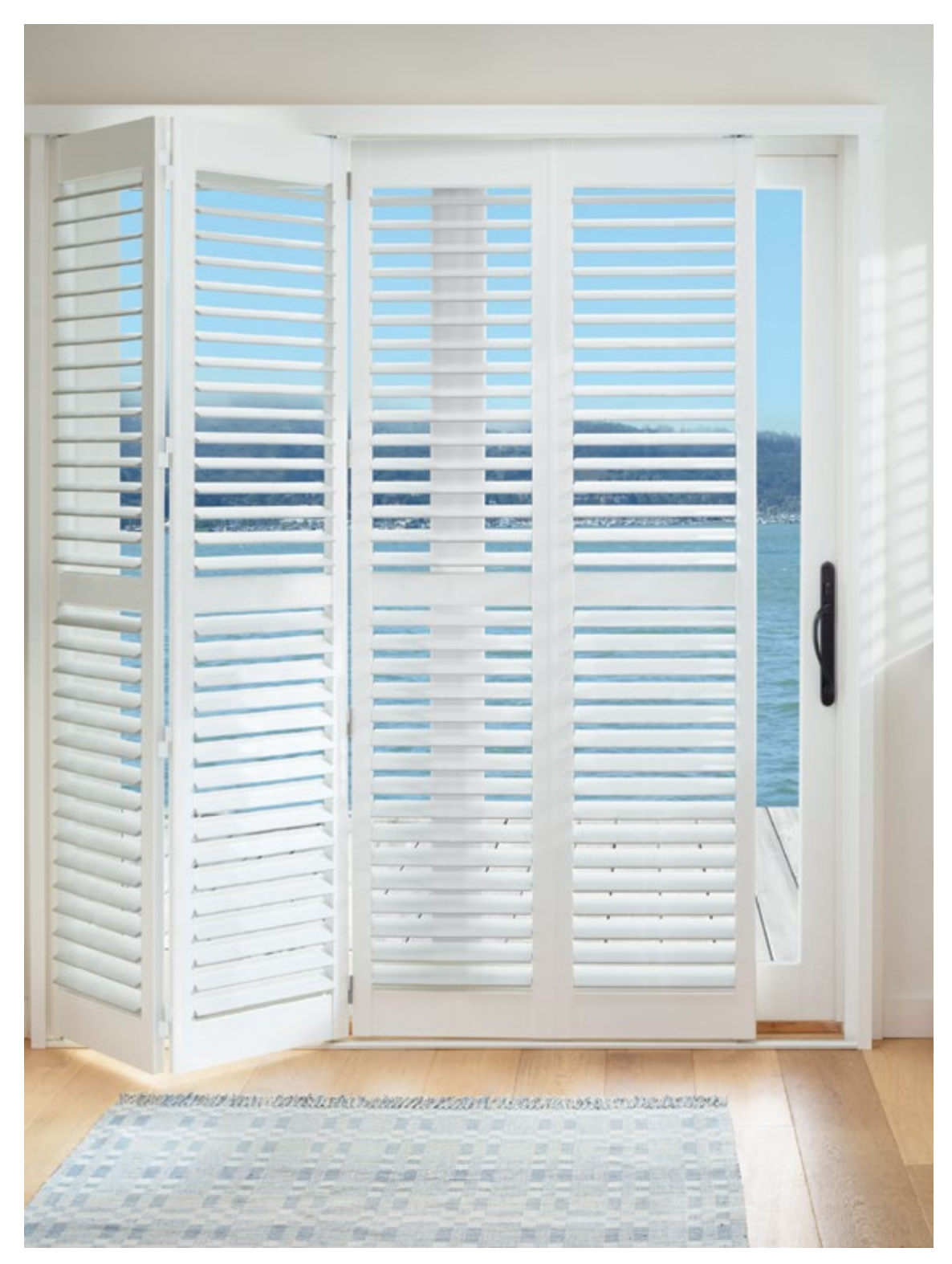
PolySatin @ Shutters, Bi ext{-}Fold on Track